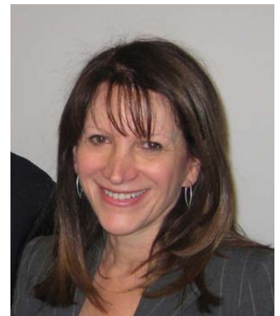
Lynne Featherstone MP (right), Liberal Democrat Parliamentary Spokesperson for Youth and Equality, will make a speech to conference at 11.10 on Wednesday 23rd September.