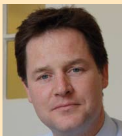
Rt Hon Nick Clegg MP