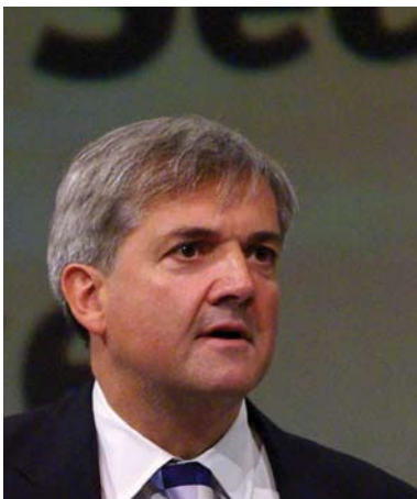
Chris Huhne MP (left), Liberal Democrat Shadow Home Secretary, will make a speech to conference at 15.00 on Tuesday 22nd September.

Bermondsey & Old Southwark and Streatham