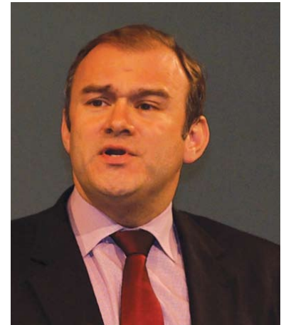
Edward Davey MP (right), Liberal Democrat Shadow Foreign Secretary, will make a speech to conference at 12.20 on Sunday 20th September.

Tesco is the UK's biggest retailer. We continue to support our customers by offering great products at low prices and helping them to tackle the issues that matter to communities and society including climate change, through carbon labelling to help customers make green choices, and regeneration, where we are creating thousands of jobs for the long-term unemployed.