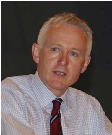
Norman Lamb MP (left), Liberal Democrat Shadow Secretary of State for Health, will make a speech to conference at 10.35 on Sunday 20th September.