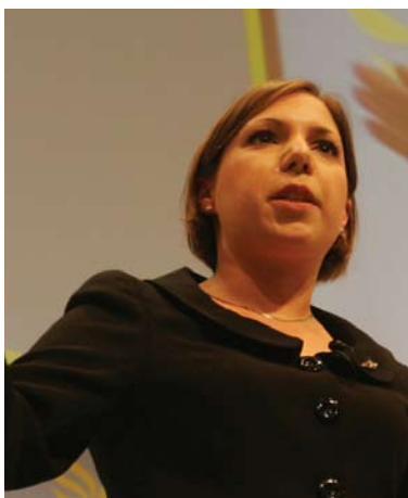
Sarah Teather MP (left), Liberal Democrat Shadow Housing Minister, will make a speech to conference at 14.55 on Monday 21st September.

This amendment will be voted on in two parts.