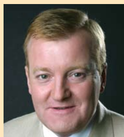
Charles Kennedy MP