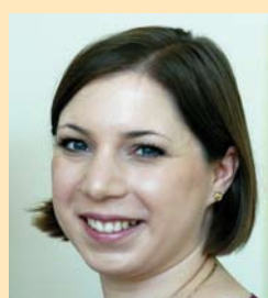
Sarah Teather MP